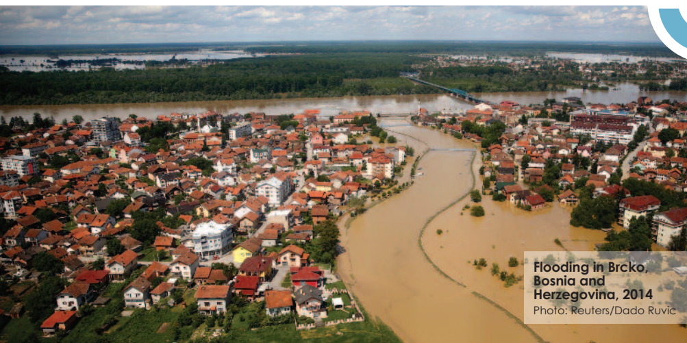
Flooding in Brcko, Bosnia and Herzegovina, 2014