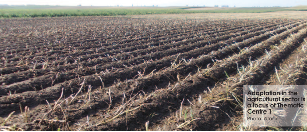
Adaptation in the agricultural sector is a focus of Thematic Centre 1