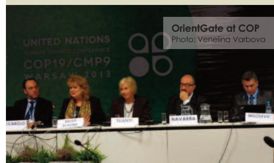
OrientGate at COP