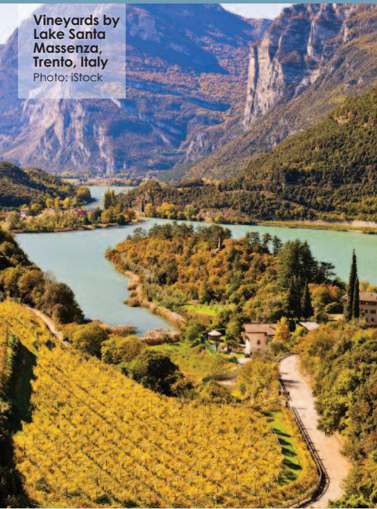
Vineyards by Lake Santa Massenza, Trento, Italy

“[We] joined the Orient-Gate partnership to further enhance our efforts to address climate change in Bulgaria at a regional level. The extensive research, analyses, case studies and policy guidelines resulting from the project will help us to integrate a number of significant topics and priorities related to coping with climate change into our national framework for regional development.