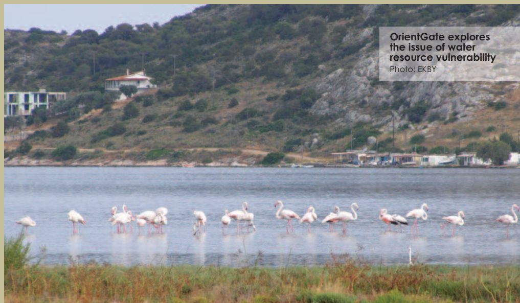
OrientGate explores the issue of water resource vulnerability

The study analyses two river catchments, the Noce and the Brenta, representing two different situations typical for the Alpine context — mountainous catchments where hydrologic behaviour differs due to the presence or lack of feeding glaciers.