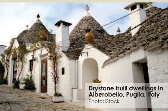
Drystone trulli dwellings in Alberobello, Puglia, Italy